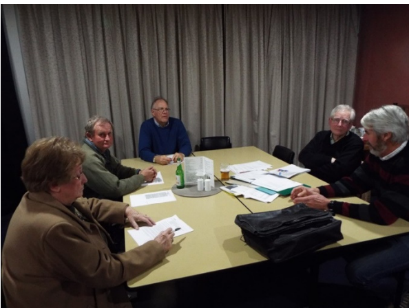
Membership committee at work