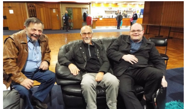
After the Community Service committee meeting

Dugald: The amount of subs payable will be determined at the next board meeting and accounts will be distributed after that.