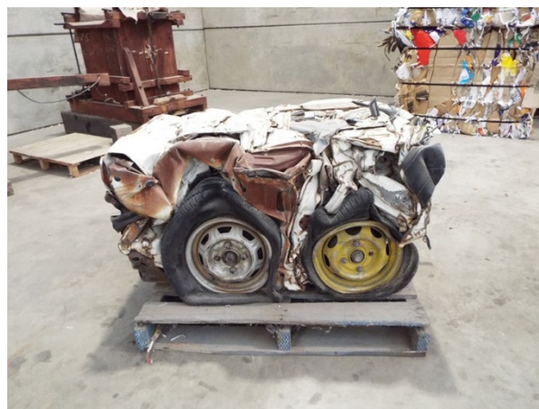
A very compact Datsun

If you are unable to attend any meeting YOU SHOULD CONTACT DARRELL GAUKROGER by LUNCH TIME THE TUESDAY before the meeting. Failure to do this will mean that you will be asked to pay for the meal. Darrell's contact details are:- Email - dgcooma@bigpond.net.au Phone - 6452 1159 Mobile - 0407 411 422