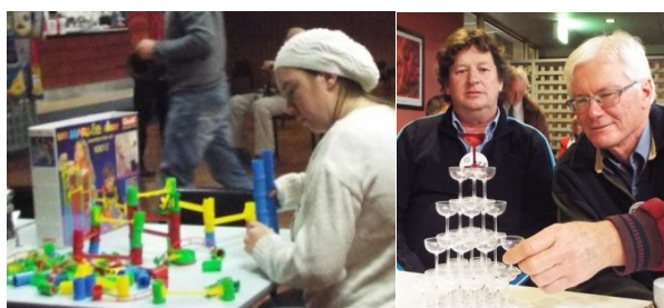
Building up and carefully taking down