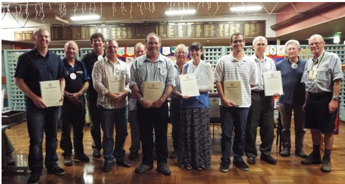
A big welcome to our new members pictured with their mentors