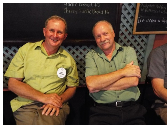
Let's mo on one of its last outings