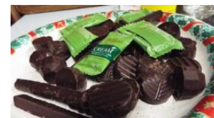
Hass forgot the port but she did remember the chocolates!!