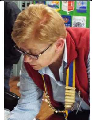
President hard at work