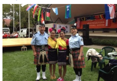
Scottish Pipers & Sri Lankan Dancers