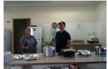
A Couple of Nights in the Blazeaid Kitchen