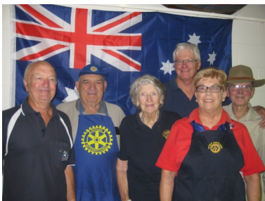
Cooma Car Club Australia Day Breakfast Team