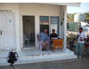
Outside the Clinic