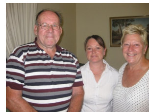
The Sovereign Team