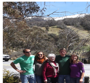
GSE team at Thredbo