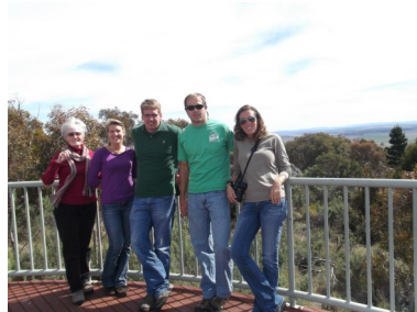
GSE team at Mt Gladstone