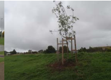
Rotary oval after deluge and Manchurian pear to replace one vandalised.