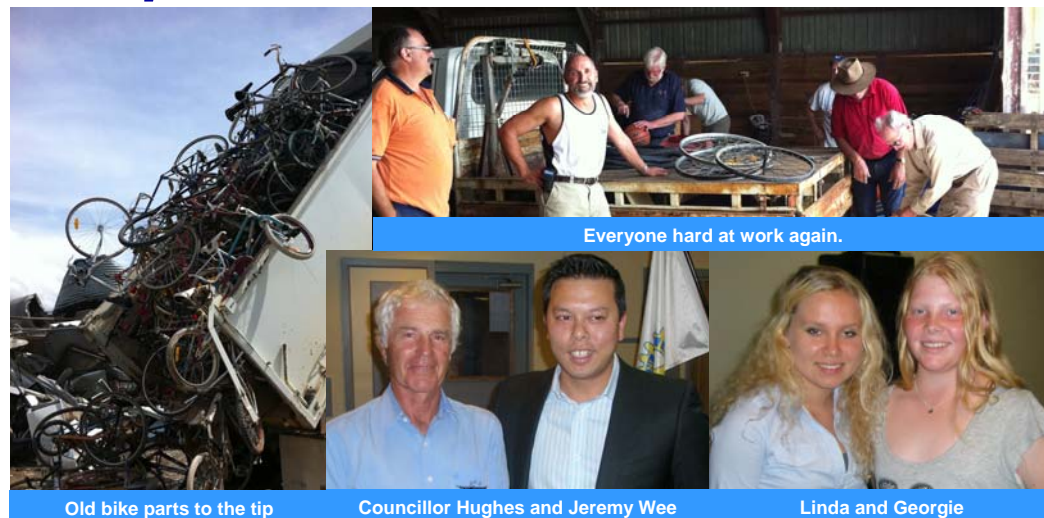
Everyone hard at work again.