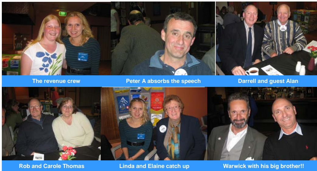
The revenue crew