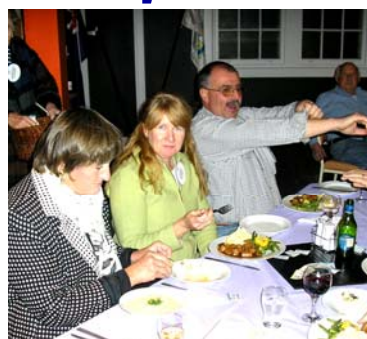
The long arm of Marco