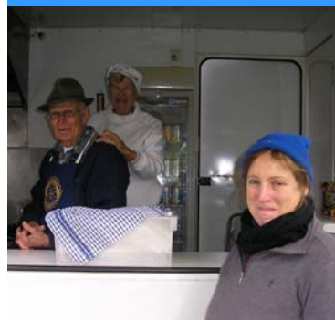
Hat day mania