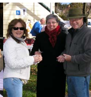
Chocolate wheel mania