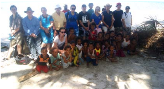
Tough times at the Coral sea