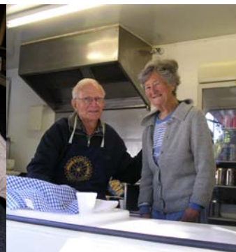
The markets team