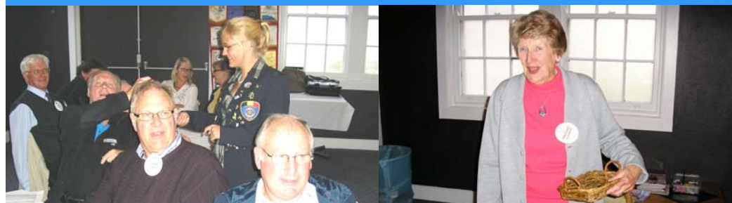
The "sinners" table 2