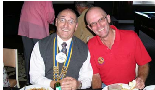
The PNG twins