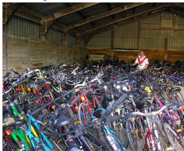
Bikes for Kemabolo