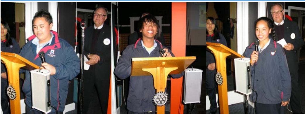
Onetree College students have their say