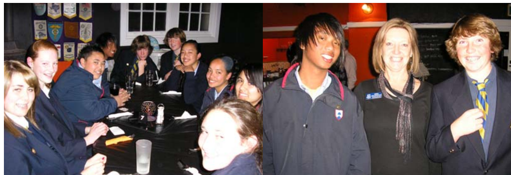
The NZ Exchange table