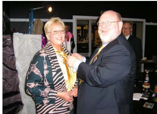
Past President pin presentation