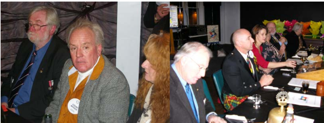
The engrossed crowd