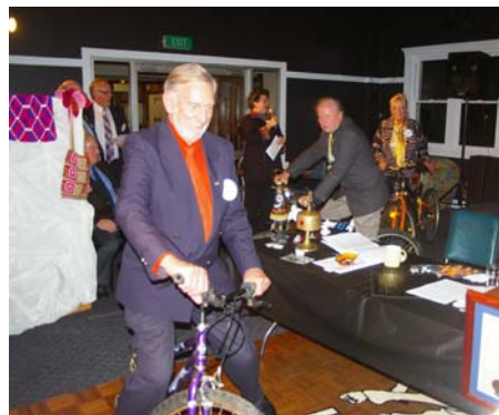
The new board are presented on bikes soon to be heading to Kemabolo