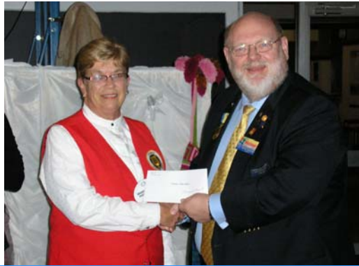
Cooma Town Band