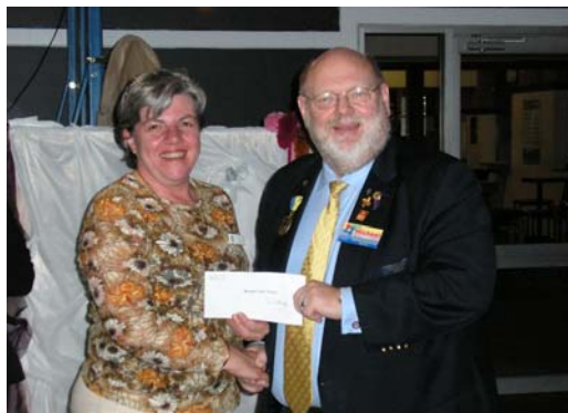
Monaro High production