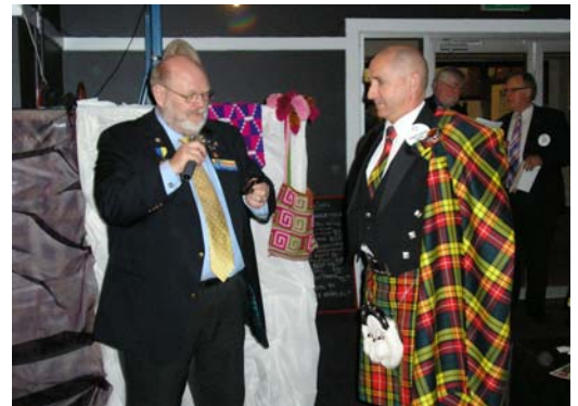
President pin presentation