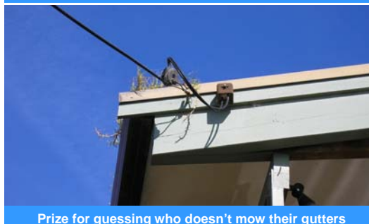
Prize for guessing who doesn't mow their gutters