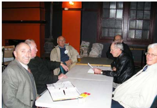
The Community Service team at work