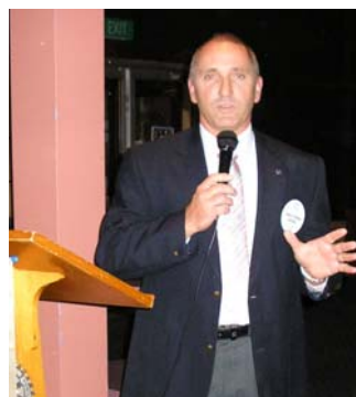
Intro by Pres Elect Chris

10,000 Yanks poured into the Australian Goldfields, some stayed on to establish businesses, including the legendary Cobb & Co coaching company. Due to the Bilateral Free Trade agreement in 2005, goods and services trade between the two countries increased by 60% by 2008, unfortunately it dropped in 2009. The US imported $US2.33 million agricultural products and consume 9% of all Australian Agri-