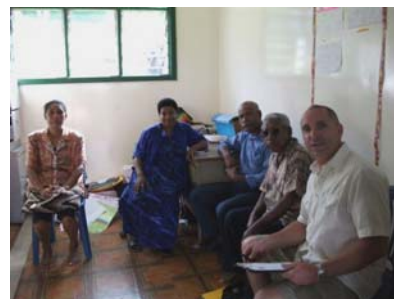
The school council meeting