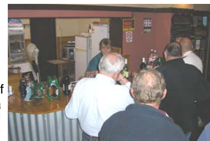
Club assembling for drinks!!