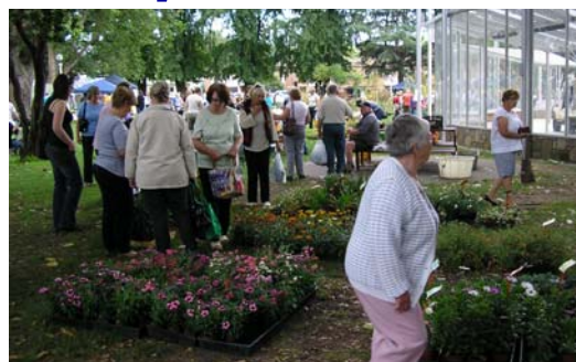
Kossie Fest markets crowd