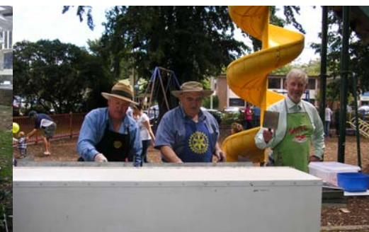
Mouldy and Des did the cooking