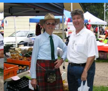
Two of a kind