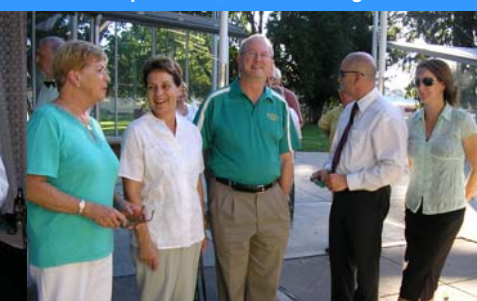
Waiting for the bus