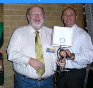
The perpetual trophy presentation