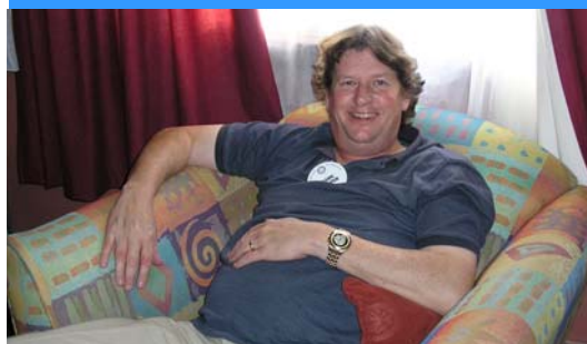
Resting up after the strain of preparing the property