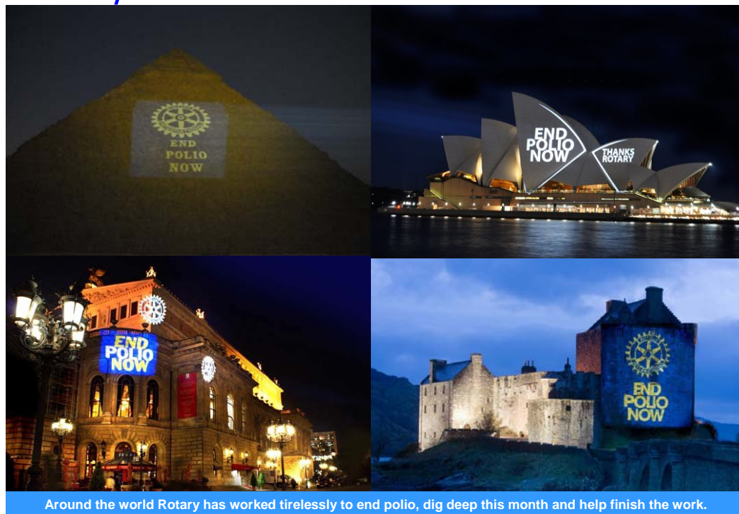
Around the world Rotary has worked tirelessly to end polio, dig deep this month and help finish the work.