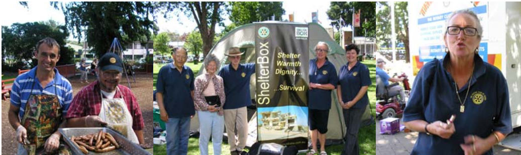
The cooks at work