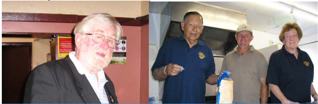
Which Banana in Pyjama is this????