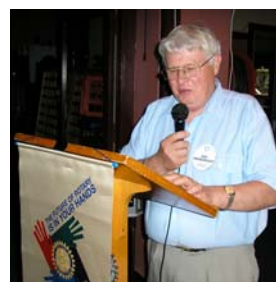
Introduction by Ken