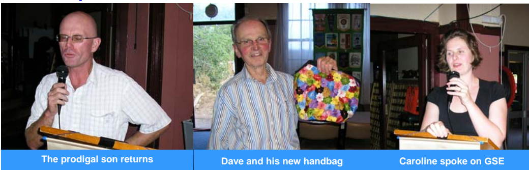
The prodigal son returns