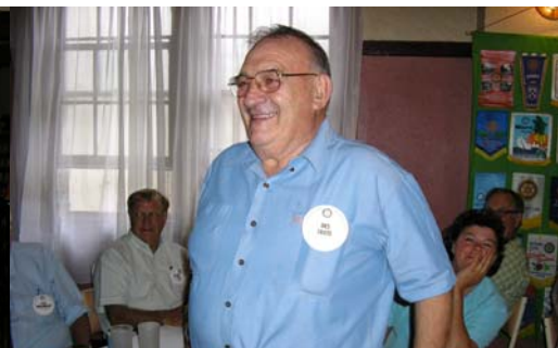
Des had to ask THAT question!