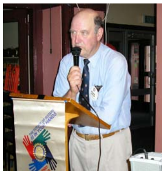
Introduction by Richard

Gallery is a shining example. Gardens were then mentioned those with the old dirt swept paths, geraniums in jam tins, circular garden beds edged in whitewashed rocks and the Raglan Gallery garden. Preserving our future - world heritage listing, national heritage listing, local/regional heritage listing. Heritage protection sometimes creates controversy and mentioned the green bans of 1970