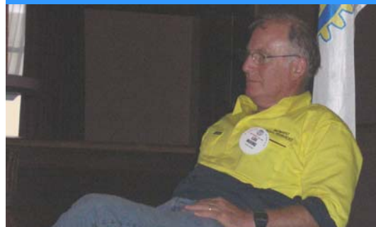
One of Cooma Club's Heritage listed items.