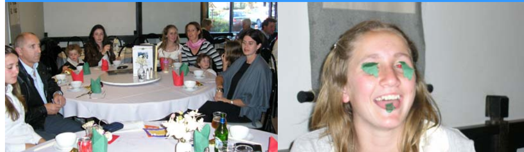
The occasion was sad and happy so the tears flowed and the laughter was loud.