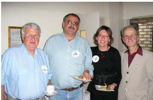
Young talent time.....