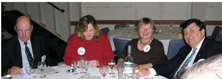
A few of Rotary's elite