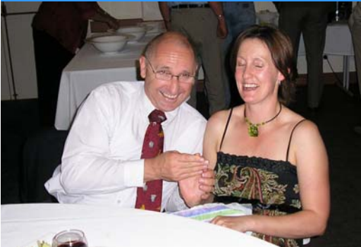
Stop, I'm ticklish