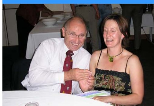
Stop, I'm ticklish