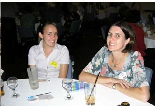
Barbie and Kym having a good time