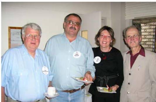
Young talent time.....