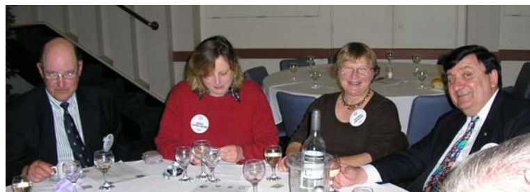
A few of Rotary's elite