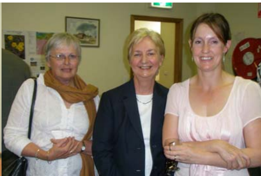
Cooma high society