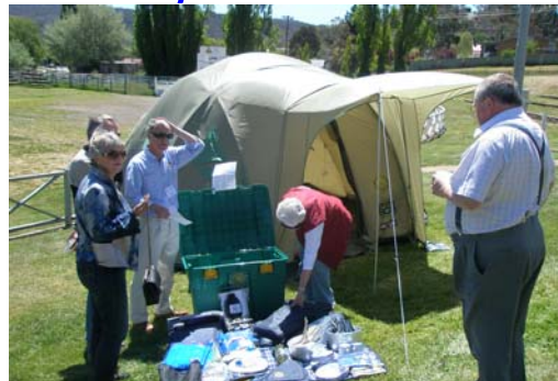
Shelter Box saw plenty of interest