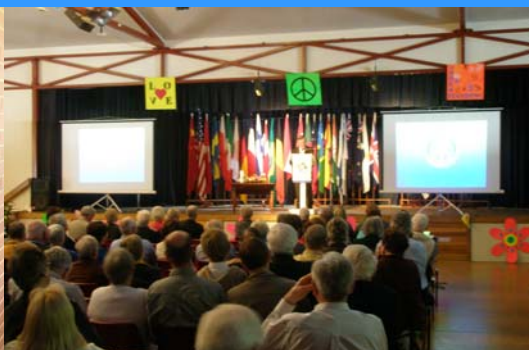
400 Rotarians and their families attended the weekend