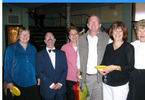
The Young Victoria screening on Thursday night