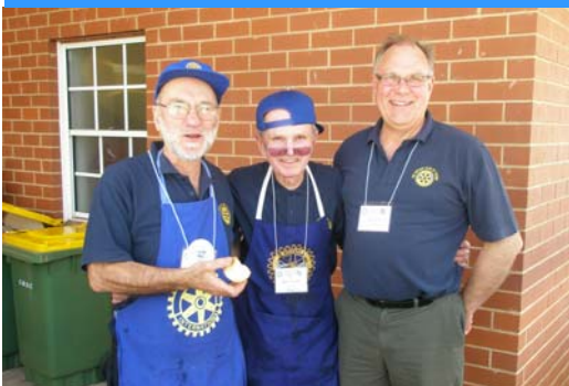
Cooma's working classes