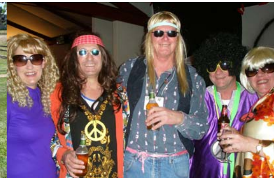
The affect of a few too many DOOBIES