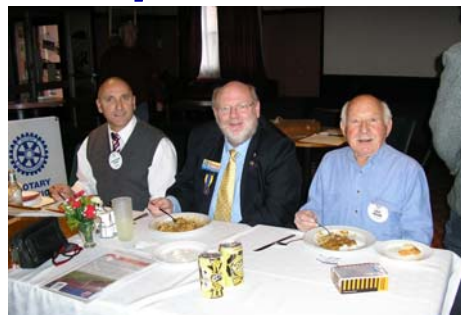
Had to turn the flash off due to the reflections