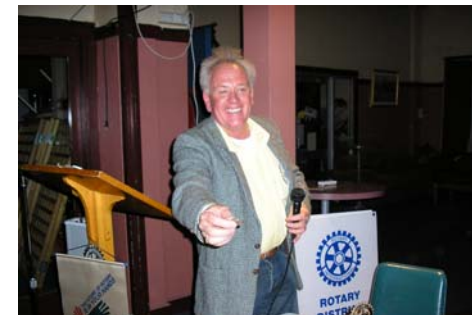
The Sergeant hammed it up!