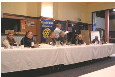
What an attentive group!