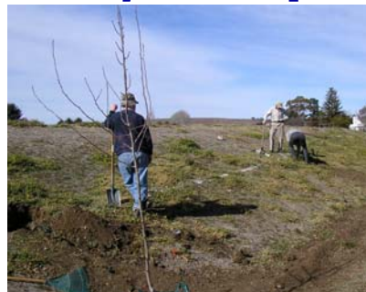
Who's that sleeping on the shovel

David Holgate reported that the tree planting at Rotary Oval went ahead last Saturday, however they dug more holes than they had trees, therefore more trees are required.