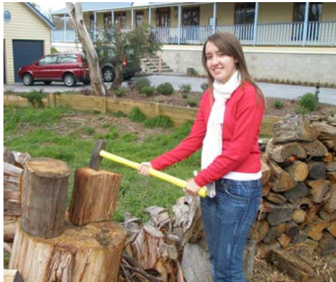
Barbie demonstrates her lumberjack skills