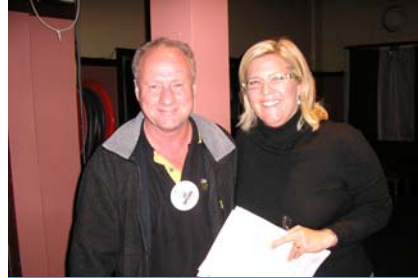
Les S. gave thanks