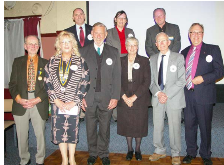
The Board of the Rotary Club of Cooma 2009 - 2010