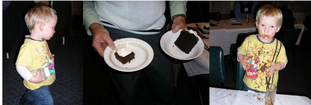
Before the surprise