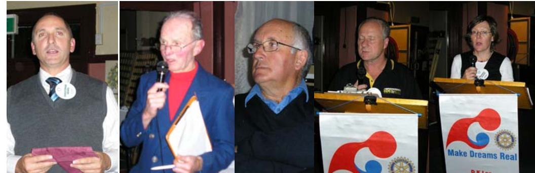
Rotary Club of Cooma Directors and Office bearers reports