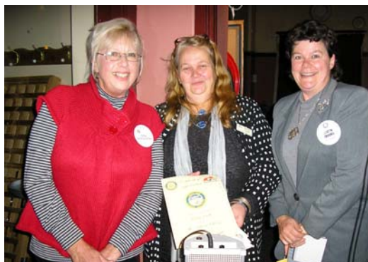
The vote of thanks

Traffic that was measured at the waterworks platypus viewing platform from 27 February to 27 April this year totaled 25,446, 85.2% of which were motorcycles. No doubt this had a good impact on the community.