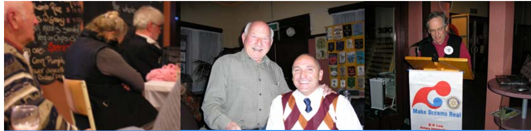
Jet lag sets in