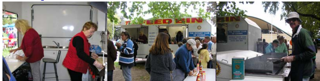
Lots to feed