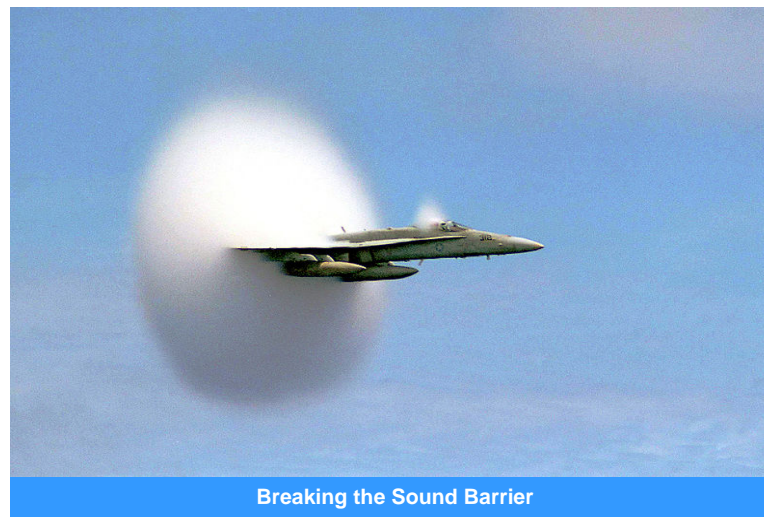
Breaking the Sound Barrier