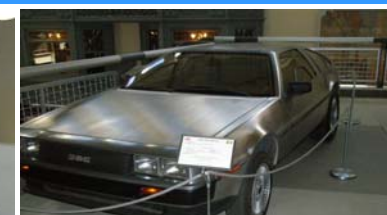
Back to the future! A 1982 Delorian