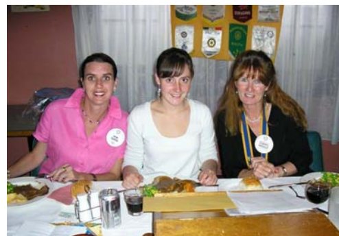
Girls Rule the head table